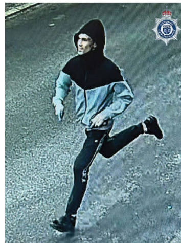
CCTV image 2