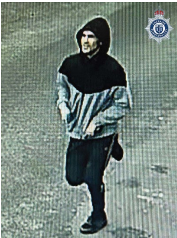
CCTV image 1