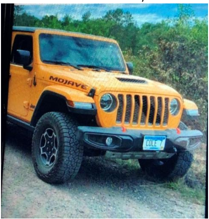
Photo of the vehicle owned by one of the Dufour's incident individuals the very next day, Aug 1, trespassing again:

Included in your packet is the full Sheriff's office report, the names and DOB of individuals are redacted as the criminal and civil property damage cases are in progress, below are the pertinent excerpts that conclusively and unambiguously establish that the fire at that time was 80-100 yards wide, trespassers lit the fire, with fireworks, and they were from Dufour's: