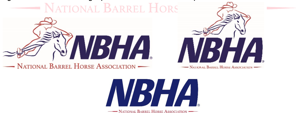
Figure 1. The Official NBHA logos (with and without horse & rider)

At no time can the logo be disassembled or rearranged beyond what is shown above. See nba.com/about/logo for color variations and more logo info.