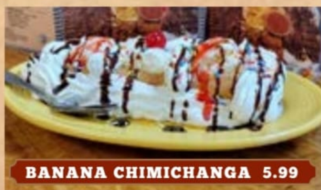
BANANA CHIMICHANGA 5.99