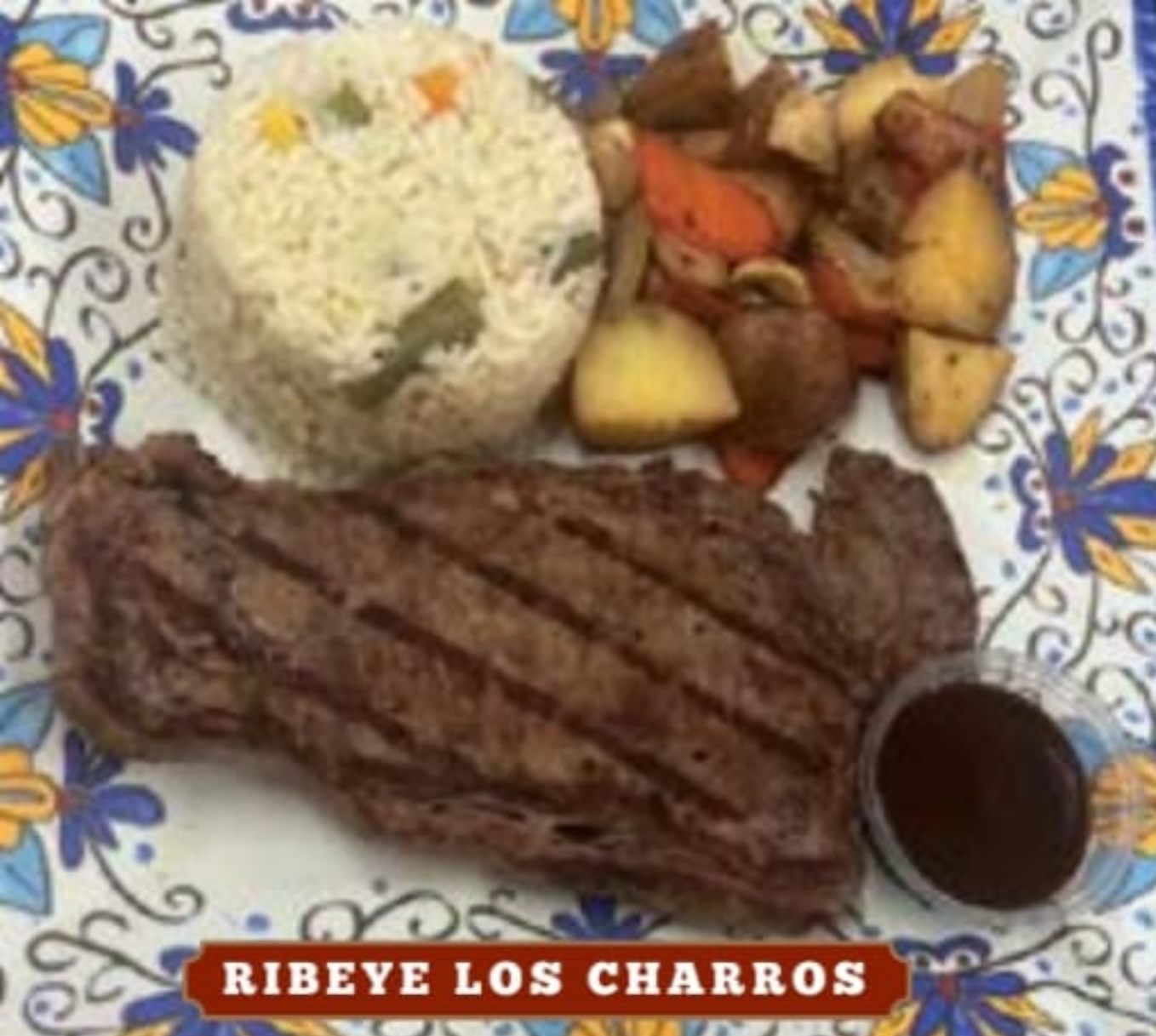
RIBEYE LOS CHARROS