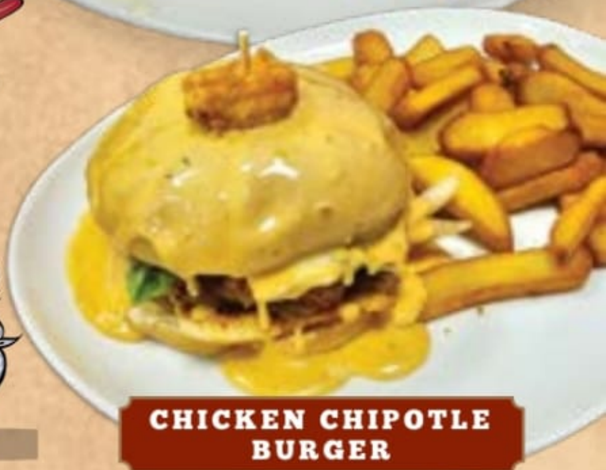
CHICKEN CHIPOTLE BURGER