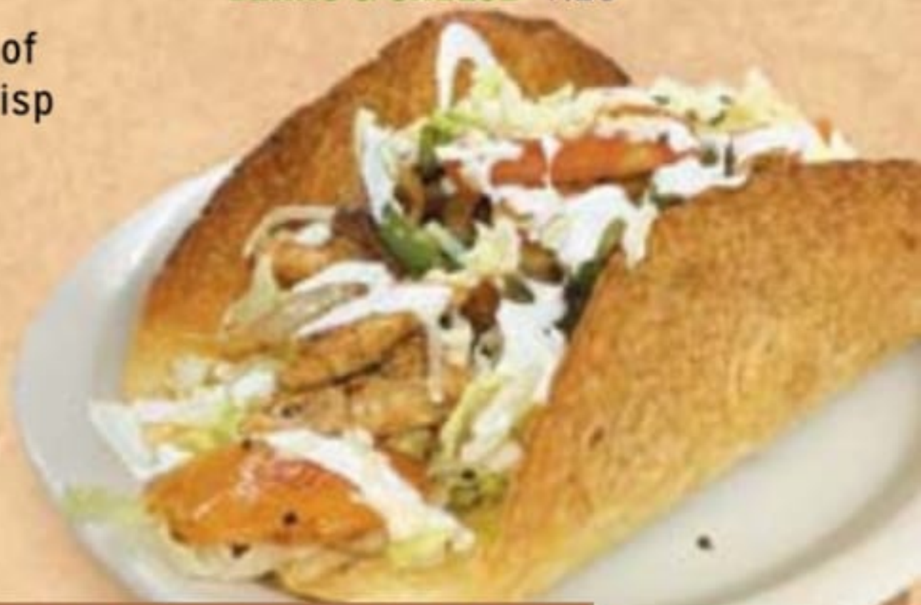
CHARROS TACO SALAD