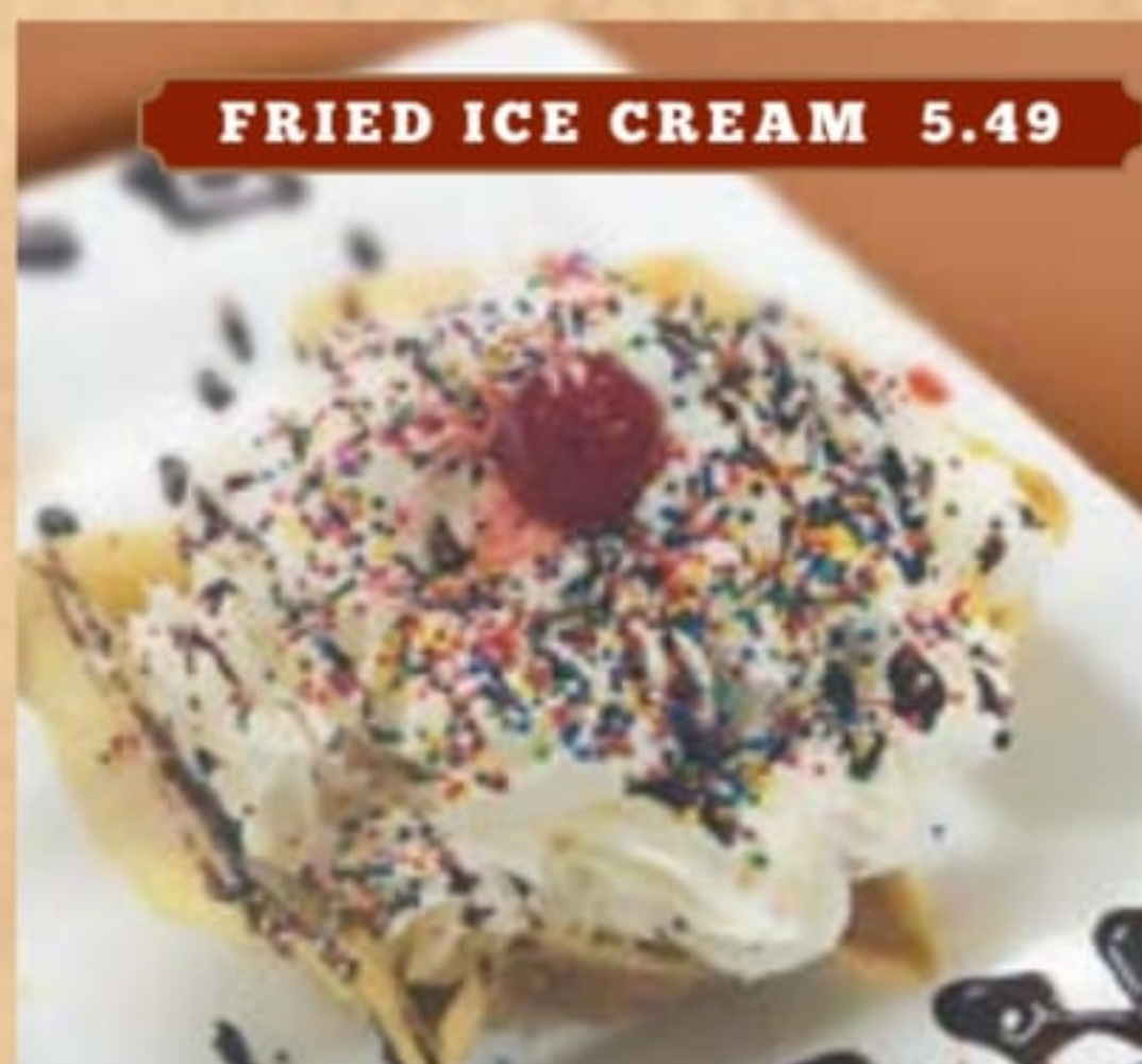
FRIED ICE CREAM 5.49