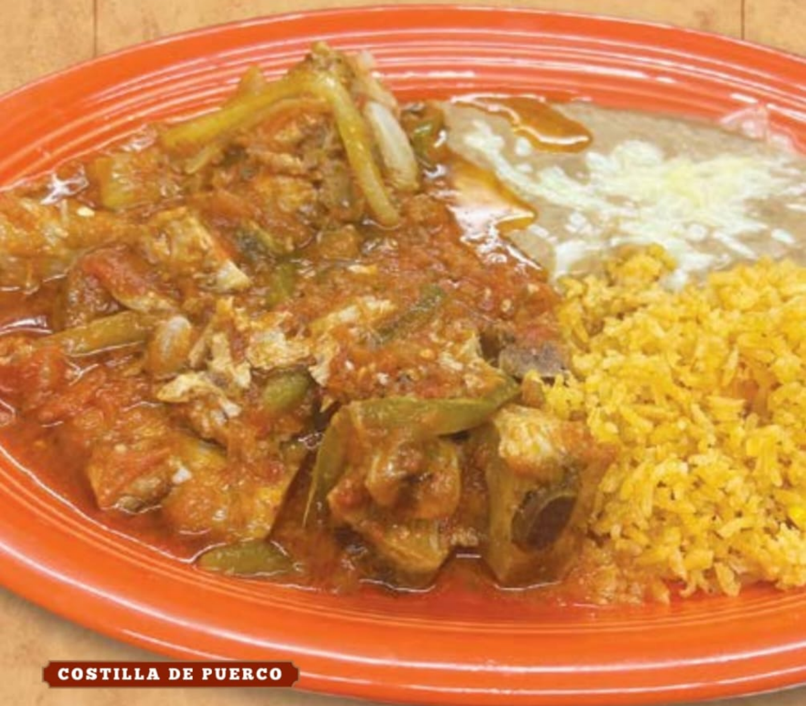
COSTILLA DE PUERCO

2124 N. MIDDLE DRIVE GREENSBURG, INDIANA 47240 812-560-4056 FAX: 812-650-4556