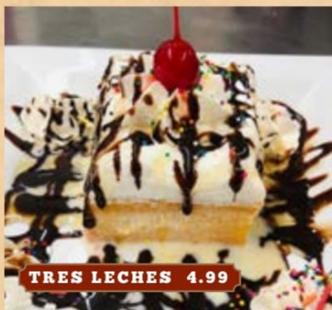
TRES LECHES 4.99