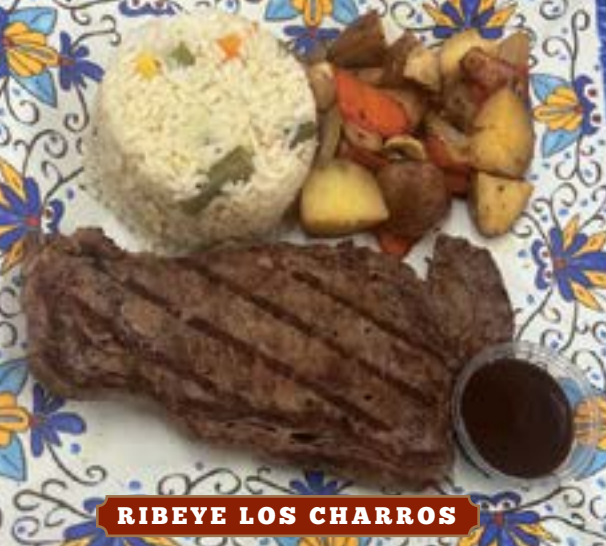
RIBEYE LOS CHARROS