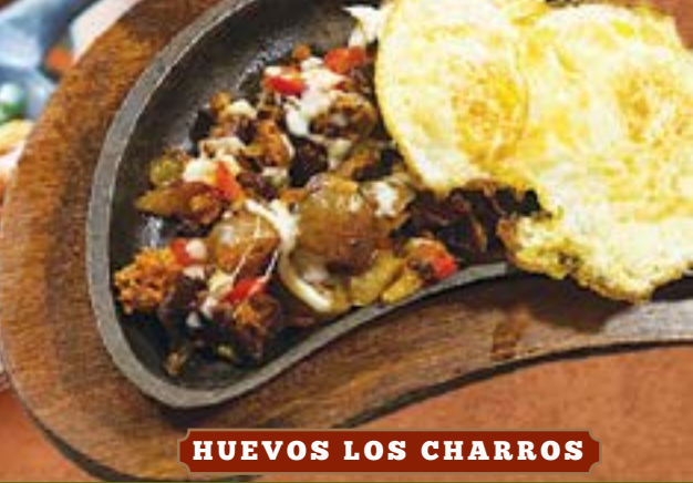
HUEVOS LOS CHARROS