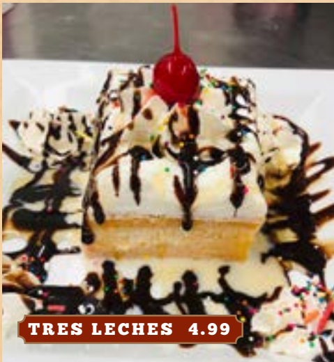
TRES LECHES 4.99