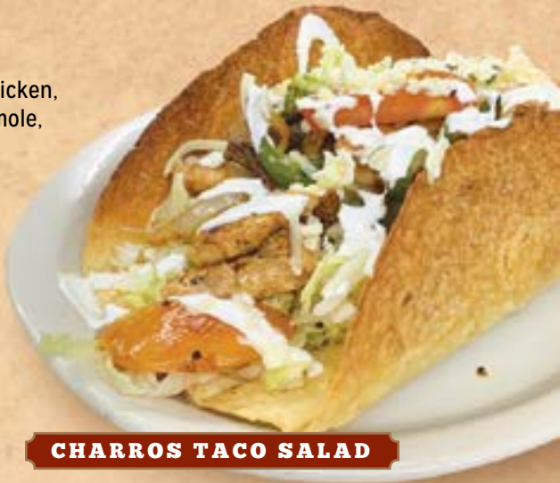
CHARROS TACO SALAD