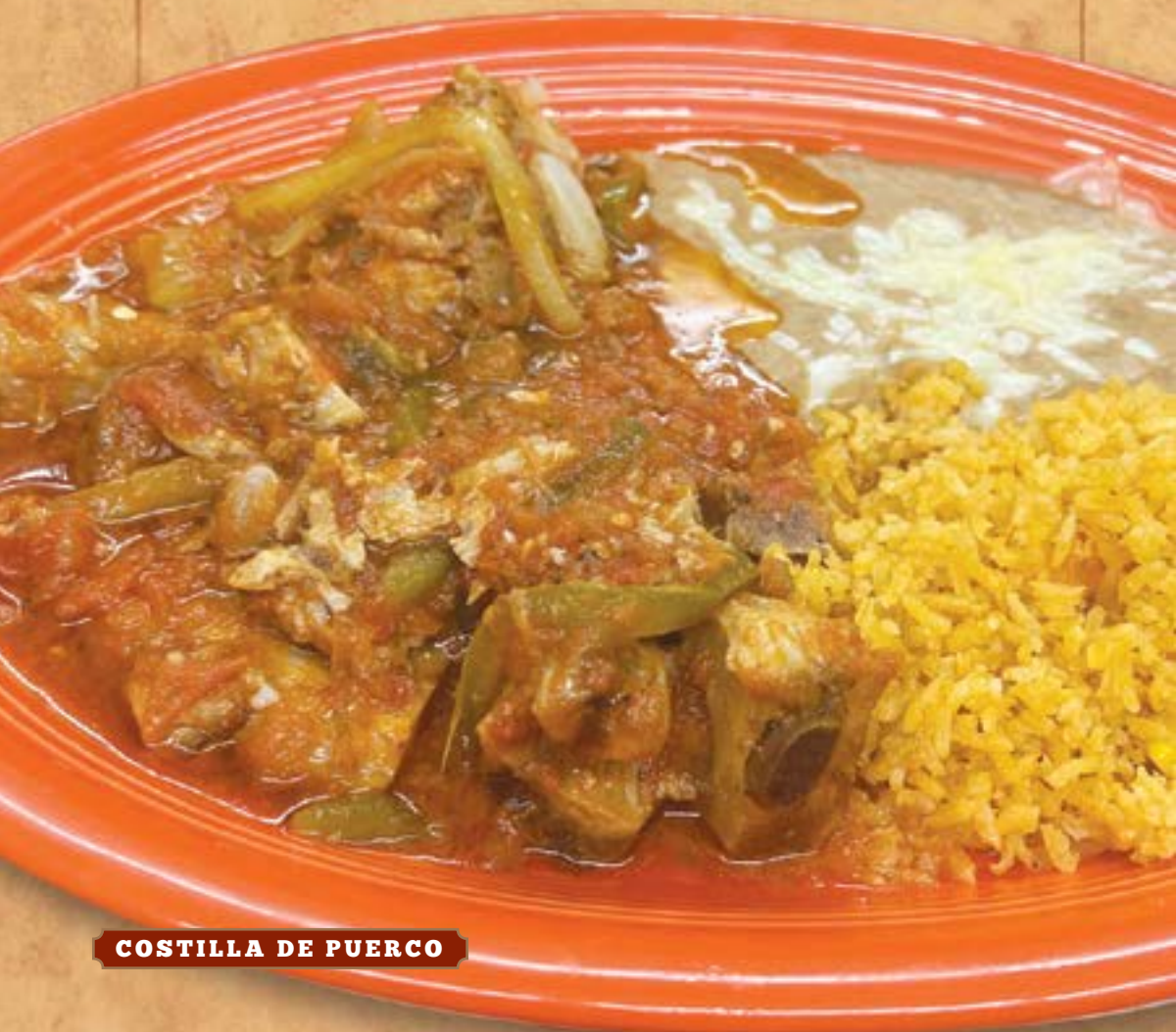
COSTILLA DE PUERCO

15 N. WASHINGTON STREET KNIGHTSTOWN, INDIANA 46148 765.571.5268