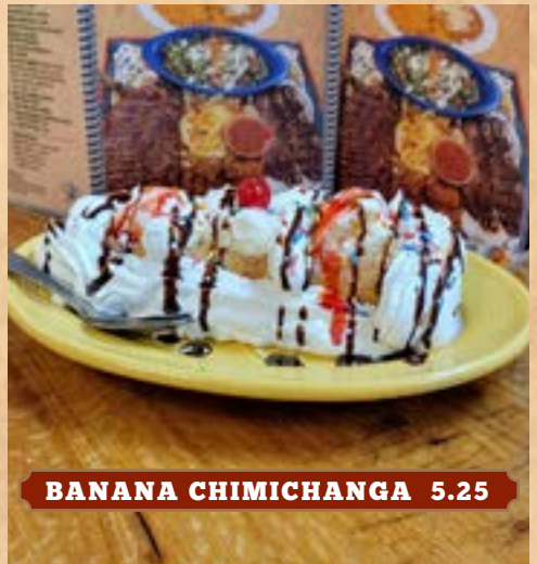
BANANA CHIMICHANGA 5.25