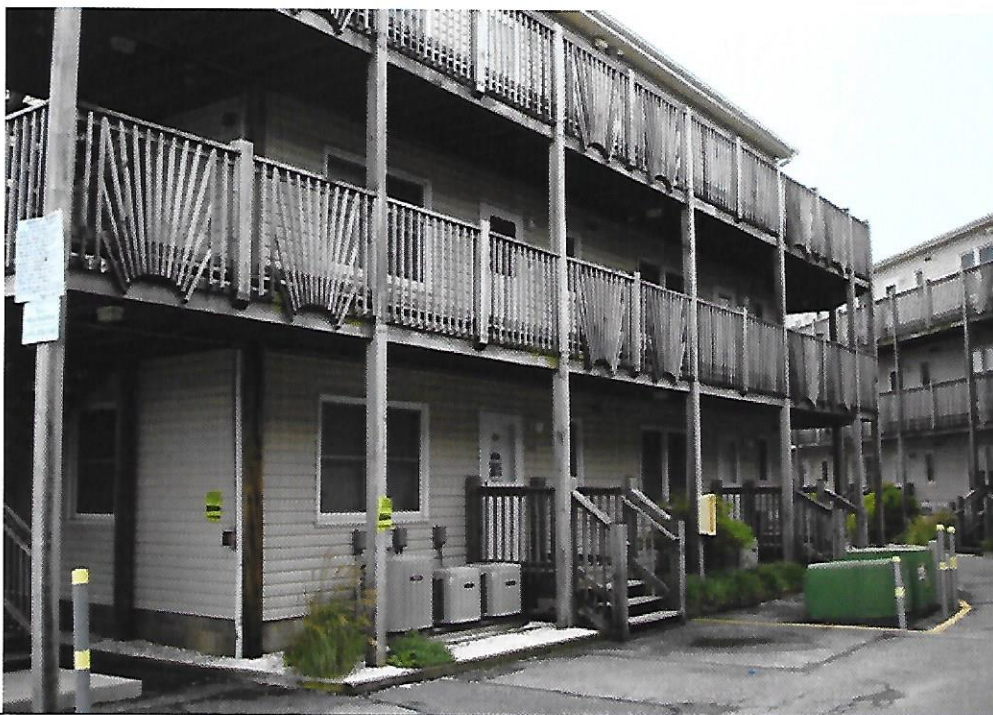
Front View of #120 53 rd Street (Building #2 – see attached plan) on 9-30-2016.

If using the Elevation Certificate to obtain NFIP flood insurance, affix at least 2 building photographs below according to the instructions for Item A6. Identify all photographs with date taken; "Front View" and "Rear View"; and, if required, "Right Side View" and "Left Side View." When applicable, photographs must show the foundation with representative examples of the flood openings or vents, as indicated in Section A8. If submitting more photographs than will fit on this page, use the Continuation Page.