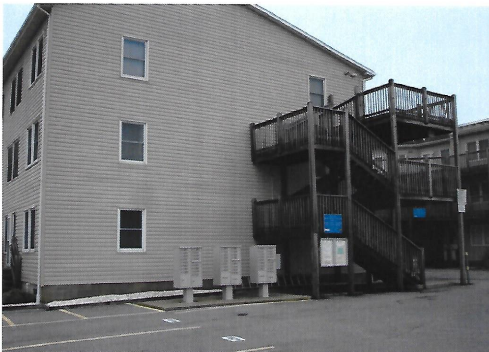
Left Side View of #120 53 rd Street (Building #2 – see attached plan) on 9-30-2016.