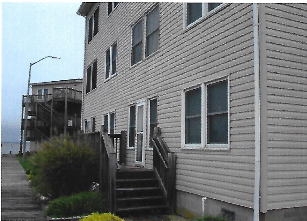
Rear View of #120 53 rd Street (Building #2 – see attached plan) on 9-30-2016.