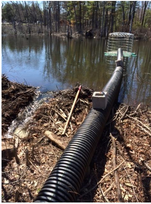
Pond Leveler Being Installed, Rangeway Rd.