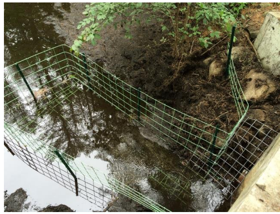
Billerica Culvert Fence w/ Wildlife Passage

Within 3 years the BMBMP was successfully managing 35 conflict sites with flow devices, and 7 sites with trapping. The trapping sites were classified as "No Tolerance Zones" for beaver damming because flow devices had either failed or were not feasible at these locations.