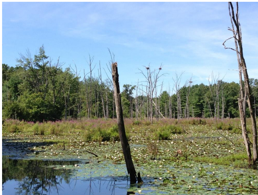
Billerica Beaver Created Heron Rookery

The use of flow devices at 43 sites in town has prevented the trapping of 38 beaver colonies. In Billerica these 38 beaver colonies create an average of 10 wetland acres with their dams, or 380 total wetland acres that would not exist if the beavers were trapped. Estimates vary but ecological value of freshwater wetlands can conservatively be valued at over $5,000 per acre per year. 4 Therefore the untrapped beavers are providing the town with approximately $2,000,000 of free ecological services every year, and over 35 million dollars in ecological services since the inception of the program.