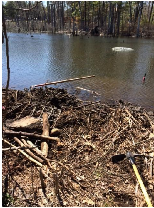
Pond Leveler in Beaver Dam, Rangeway Rd.