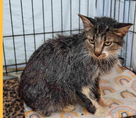
Sweet Bessie (below) qualifies for our Special Paws Program*, while charming Bella recently lost her human, and affectionate Precious lives up to her name. All three need new, forever homes.