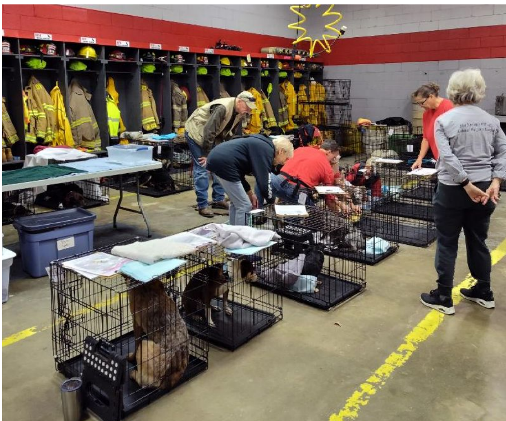
Baked Treats at Rock Porch benefit the AWL