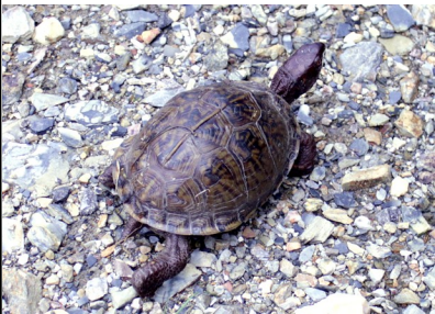
<Three-toed box turtle in the Village>

Arkansas is home to two varieties: the three-toed and the ornate box turtles. The common three-toed turtles have a plain shell that may have yellow and black markings while rarer ornate box turtles have dark brown or black dome-shaped shells with many yellow lines and markings.