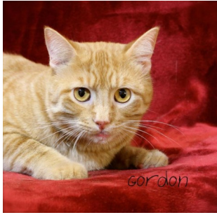
Handsome ginger Gordon with the deep orange eyes is now in his new home. He lost his home, but found AWL and a new home! Hooray for him and his new family.

Our dedicated volunteers are amazing. Join us as we work to Save Them All. Help Us Help Them!