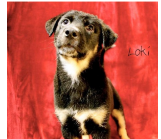
Loki's adoption photo

We arrived at the shelter and saw the puppies doing what puppies do – running all over the pen, bumping into each other, and enjoying new faces to play with them. Our AWL volunteer had a very cute little guy nuzzled in her arms. I asked to hold the little guy and