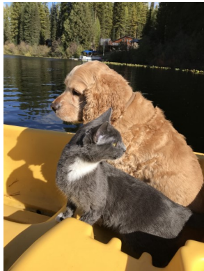
Boating together, then loving each other