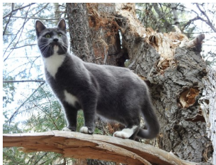
Poseidon, adventurous travel cat