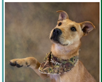
Jasper is a fun-loving rough coated terrier mix who is a great family pet. He found his forever home because he is so good with everyone and even other dogs.

Adoptions: 11 dogs, 22 cats HUG transfers: 11 dogs Spay/Neuter: Grand total is now 7,170 through 2020.