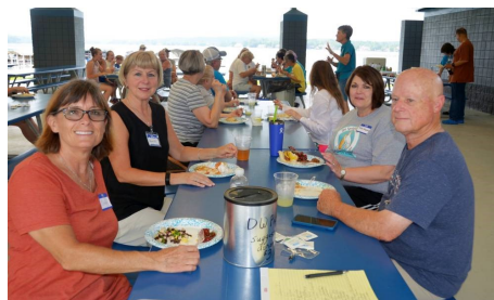
All seemed to have a great time !