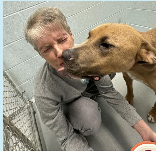
...and after a taste test, gratefully gives her a kiss!