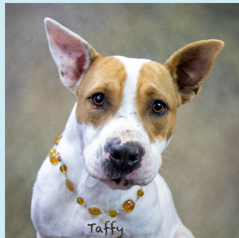
Taffy, a very sweet terrier