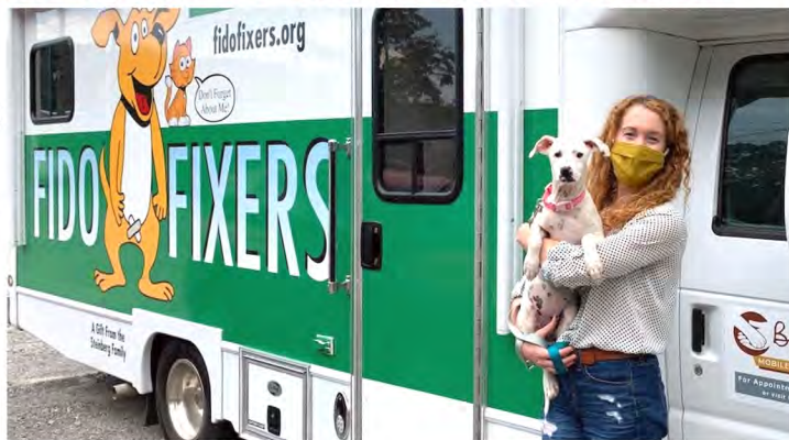
One of the mobile surgical vehicles provided by Fido Fixers, a 501 (c)(3) based out of Greenwich, CT., that we will be using for our spay neuter clinics.