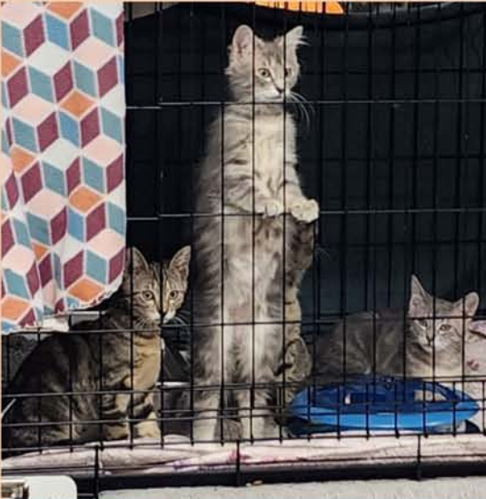
Litters of kittens are isolated in cages while they are being treated and cared for.

A Huge Undertaking - The second kitten shelter was set up in a foster home that was already caring for adult cats recovering from illnesses, surgeries or injuries. Tables, crates and supplies were set up in a separate room to isolate and care for the kittens. To treat ringworm, a three prong approach was used: environment management, treating the kittens with daily oral medication, and weekly baths given by a volunteer.