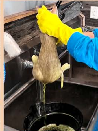
To treat the ringworm, kittens receive daily medication and weekly baths.

As more kittens came into the system, it became evident that additional help was needed. Volunteers worked on a schedule seven days a week. Multiple crates, litter boxes, scoops, and loads of laundry were constantly washed and disinfected. Additionally, a few husbands of the volunteers helped haul away trash and took cardboard boxes to the recycling center. At one point, 45 kittens were being treated at the same time in the isolation room. It was well organized and with the help of Waggin' Wheel vet care, all of the kittens recovered in a few months.