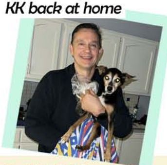
KK back at home