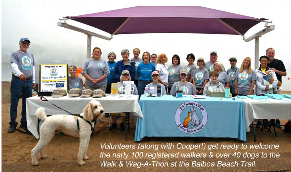
Volunteers (along with Cooper!) get ready to welcome the nearly 100 registered walkers & over 40 dogs to the Walk & Wag-A-Thon at the Balboa Beach Trail.

Overcast skies didn't stop the great turnout of walkers, supporters, volunteers and most importantly, our fabulous canine friends, who participated in our 2nd Walk & Wag-A-Thon on May 6th. Nearly $6,000 was raised to help our homeless pets! Special thanks to all our wonderful sponsors who helped make the event truly a "fun"raiser. (cont'd on page 2)