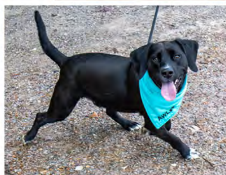
The awesome and very friendly dogs were the stars of the show as they strutted along the Trail!