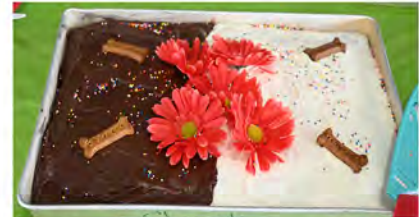
No bones about it - every party needs a cake, thanks to Cheryl White