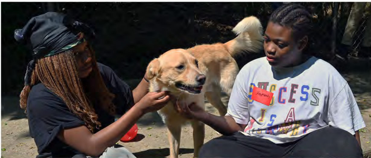
*JAG helps young people of truly great promise succeed both in school and on-the-job, leading to a productive and rewarding career. Jobs for America's Graduates is led by a public/private partnership at the national level.