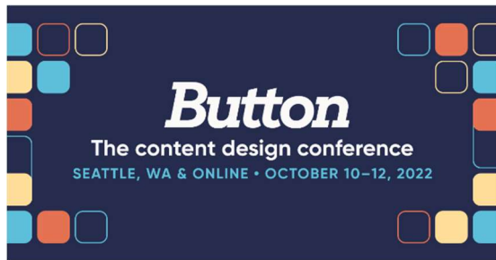
Image description: Dark background with colorful buttons with white text: Button the content design conference