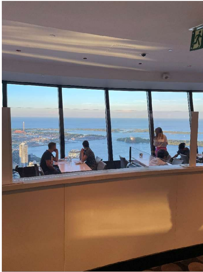
Image description: An image of the dinner view from the CT Tower in Toronto, with the skyline and water views in the background.