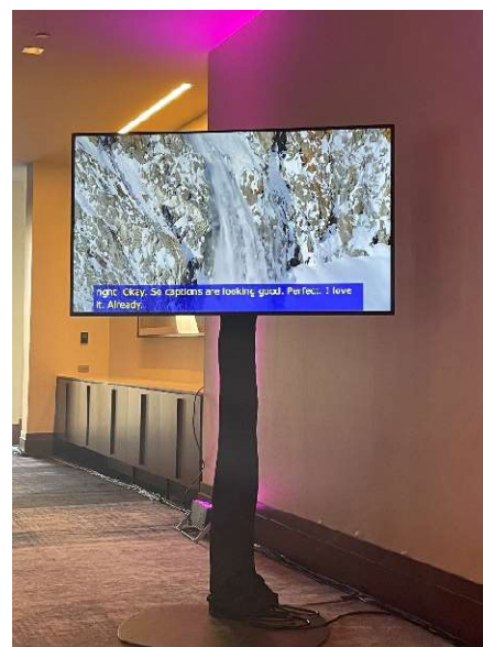
Image description: A large LCD screen in a conference room with captions test overlayed on a mountain range with the captions: Right. Okay. So captions are looking good. Perfect. I love it. Already.

Thomas recently traveled to Boston for a client he's worked remotely with since 2020, and it was wonderful to meet virtual friends in person and meet new ones. The following picture is an example of the on-site set using CART captions via StreamText and VMIX to overlay captions. This was an easy fast set up for open captions.