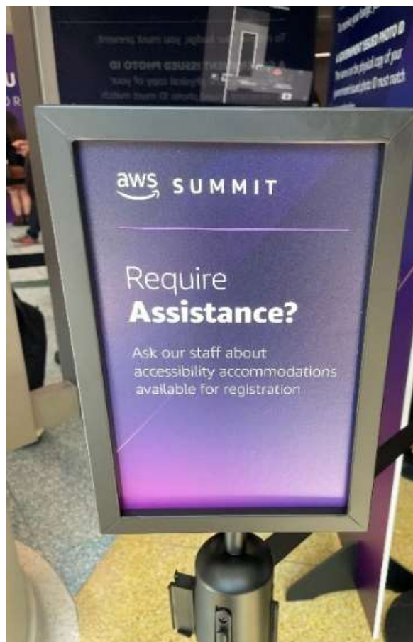
Image description: A picture of an AWS Summit sign for attendees that require accessibility accommodations available for registration from a recent event Thomas helped support as part of a four-person captioning team.

Keep in mind while Caption Nerds, LLC is a proudly small business, we are well-networked within the captioning industry with a diverse group of colleagues and can scale up for larger events, allowing multiple captioners for breakout rooms, or multiple individuals at one event that request individual accommodations.