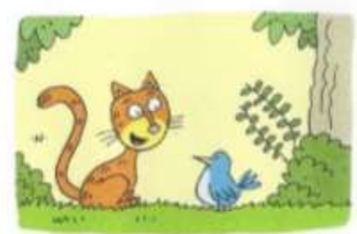
"It's year lucky day. I just went vegual."