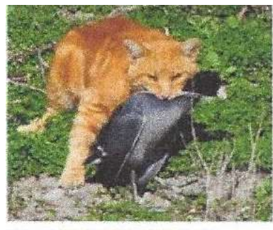
lef with American Copt by Debi Shearneter.

Sidenote: In England, beforeWorld War 2 started, domestic rabbits were valuable and encouraged to be kept since they would in return provide wool and a food source. However, out of fear for the wellbeing of the beloved pets 400,000 dogs and cats were killed. Why do we not show this same level of compassion? The concern for the wellbeing and quality of living seems to have been forgotten.