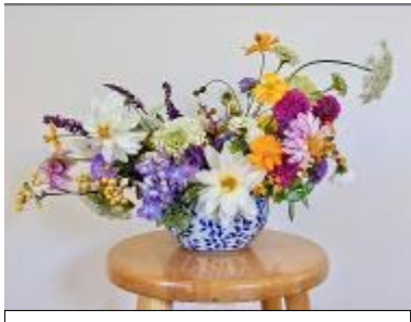
Black Bantam Florals