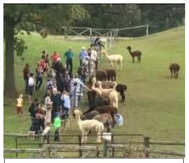
Alpacas and people at Lazy Acres Farm

Ontario County offers local products: A (Alpacas) to Z (Zucchini) and something for everyone!