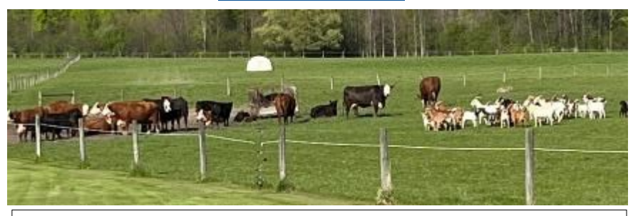
Rosecrest Farm Beef and Goats

2865 Cooley Road, Canandaigua, NY 14424 Products: Beef and goat Season: Year Round by appointment Contact: 585-394-5918 or rosecrestfarm@aol.com