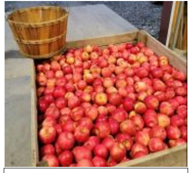
Apples at Rizzo Fruit Farm