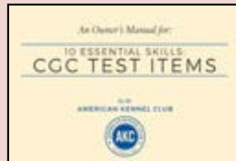
10 ESSENTIAL SKILLS: CGC TEST ITEMS