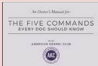
THE FIVE COMMANDS EVERY DOG SHOULD KNOW

We hope this information was valuable to you in helping your puppy live a long, healthy, happy life. Below, find additional books in our Owner's Manual series designed to strengthen the bond between you and your furry family member.