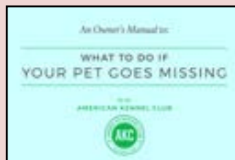
WHAT TO DO IF YOUR PET GOES MISSING