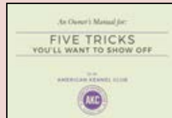
FIVE TRICKS YOU'LL WANT TO SHOW OFF