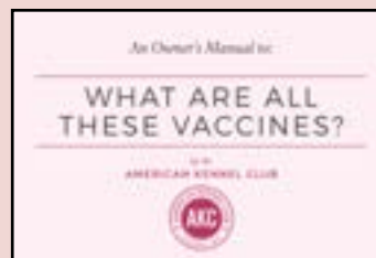
WHAT ARE ALL THESE VACCINES?