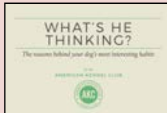
WHAT'S HE THINKING?