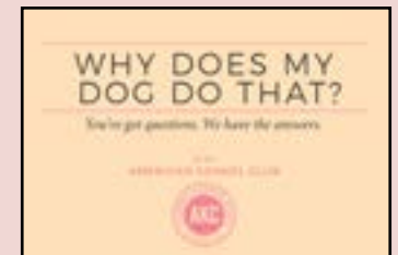
WHY DOES MY DOG DO THAT?