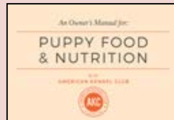
PUPPY FOOD & NUTRITION