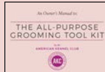
THE ALL-PURPOSE GROOMING TOOL KIT