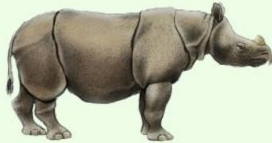
Lesser One-Horned Rhino (Javan Rhino)