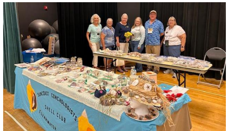
Club table at the St. Pete Shell Show - thx Betty