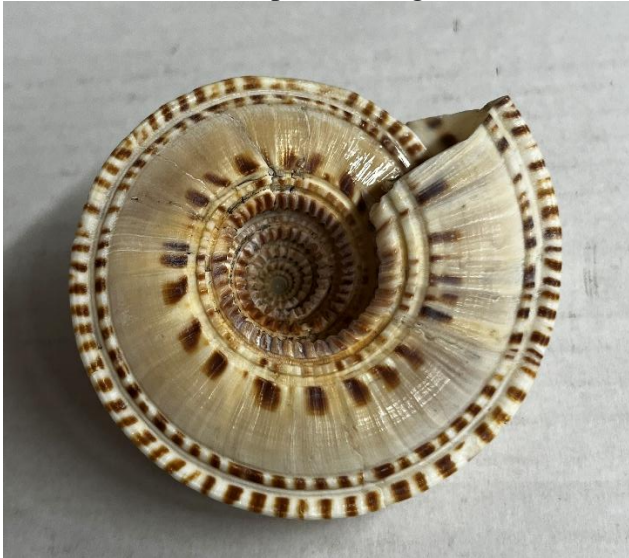
How do you spell umbilicus ?