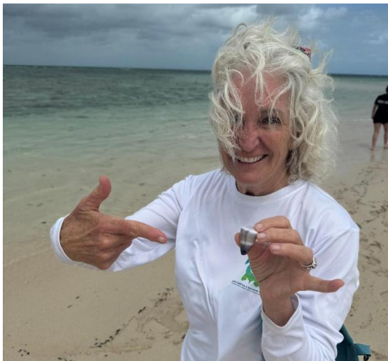
Australian cone !

Copyright 2025 by Suncoast Conchologists, Inc.