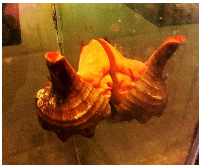
Have you ever seen a live horse conch ?