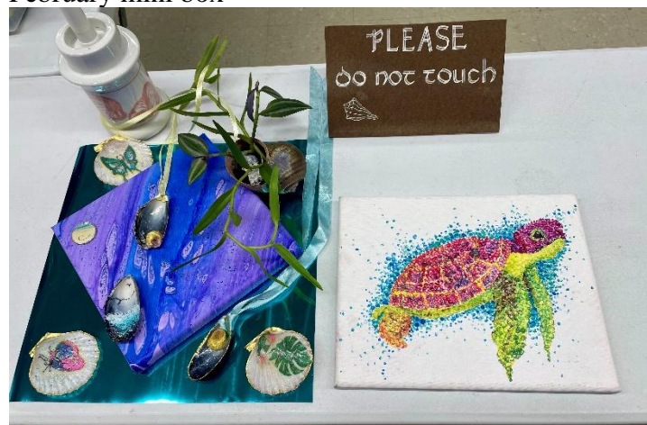
February mini box

Friday, April 4th, 2025 , 7pm, St. Petersburg Shell Club meets at the Seminole Recreation Center, Seminole, Florida. Program to be announced.