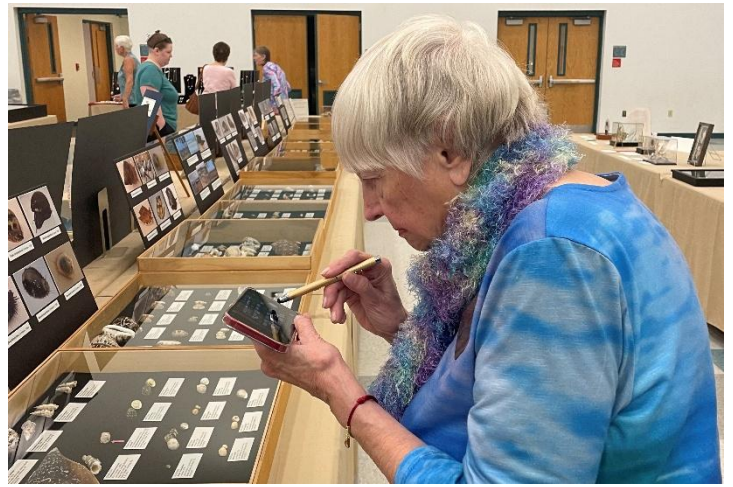
And pictures from the Show....