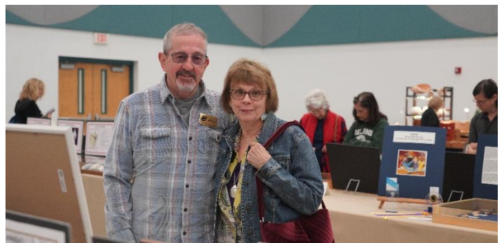
Most of the show photos by Ying Tong