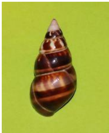
Liguus fasciatus castaneus