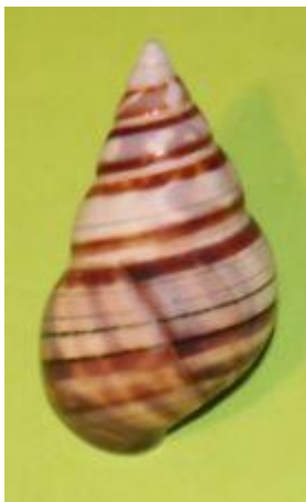
Liguus fasciatus floridanus

To whet your appetites, here are pictures of some Liguus species similar to those in February's Silent Auction. You definitely won't want to miss out on this wonderful opportunity to add to your collection!