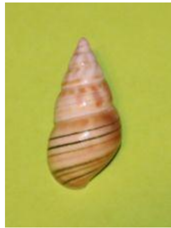
Liguus fasciatus wintei