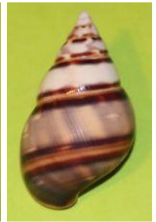
Liguus fasciatus barbouri