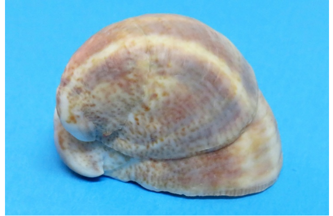
Atlantic Slipper Shells collected on a RI beach--note the stack formation common with these Slipper Shells—and—no spots!

I immediately noticed that each whelk had a slipper shell living on it that was very different than the usual species we commonly find in our area, the Atlantic Slipper Shell, Crepidula fornicata . These two Calyptraeidae both had a white background with very small brown spots on them. I'd never seen slipper shells with spots in Tampa Bay ever before!