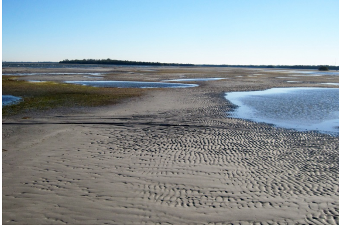
South Skyway, Manatee County--minus 0.9 tide, January 21st, 9 AM

Many of you already know that on the very cold morning of January 21st, Earl and I bundled up in several layers and headed south to the Skyway. A minus 9 tide was calling! I knew that at 9:00 the 7AM winter tide would still be quite low. And—yes—LOW it was!