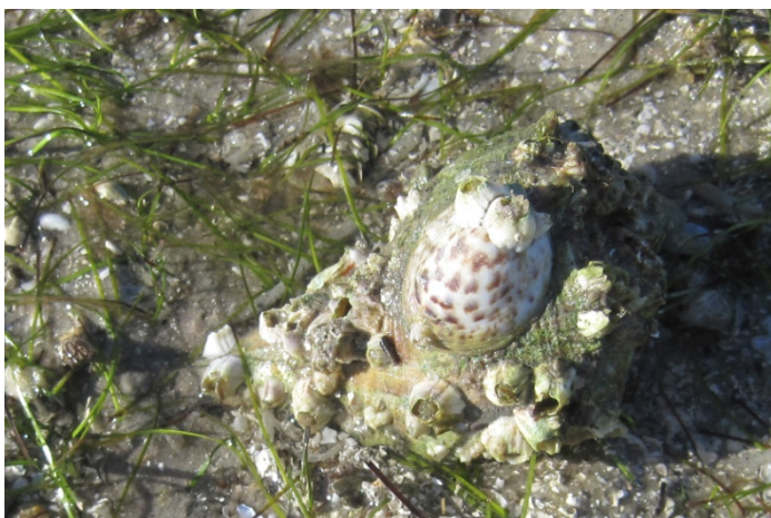
Lightning Whelk in sand with a Spotted Limpet

We weren't looking for anything special—just something for our aquarium. I tied on my warm scarf and we set out to see how far we could go on that cold, windy morning! Some of the usual shells often found were there—Lightning Whelks, Banded Tulips, Lettered Olives, and while picking up some of these and taking photos, I came across two very dead shells—one a Lightning Whelk, the other a Pear Whelk. Believe me—most shellers wouldn't even have given either of those whelks a second glance! Each was covered with barnacles, algae and tiny shells—one even had an unusual growth about an inch long on it—definitely two shells for the aquarium!