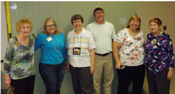
and a team effort helped prepare them for the event