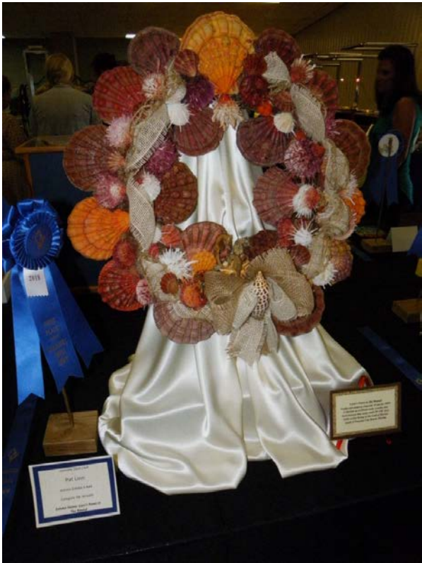
Lions Paws in the Round

The display on Olives also was awarded the DuPont Trophy in Sarasota, and 1st place in Minor Family and the Selma Lawson Award at the St. Pete Shell Club's annual show.