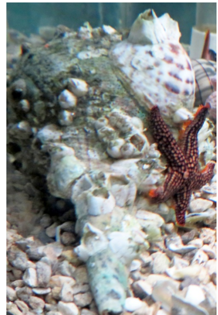
Spotted Slipper Shell, Crepidula maculosa at home in our aquarium

These slipper shells lived on the whelks' backs in our aquarium for 7-10 days before they each became dinner for some Kings Crowns. Several days later, I decided to get out a book or two. Yes—low and behold, there they were, the Spotted Slipper Shell, Crepidula maculosa ! In all my years of shelling, with thanks to an extremely low -0.9 January tide, these are the first two in my collection!