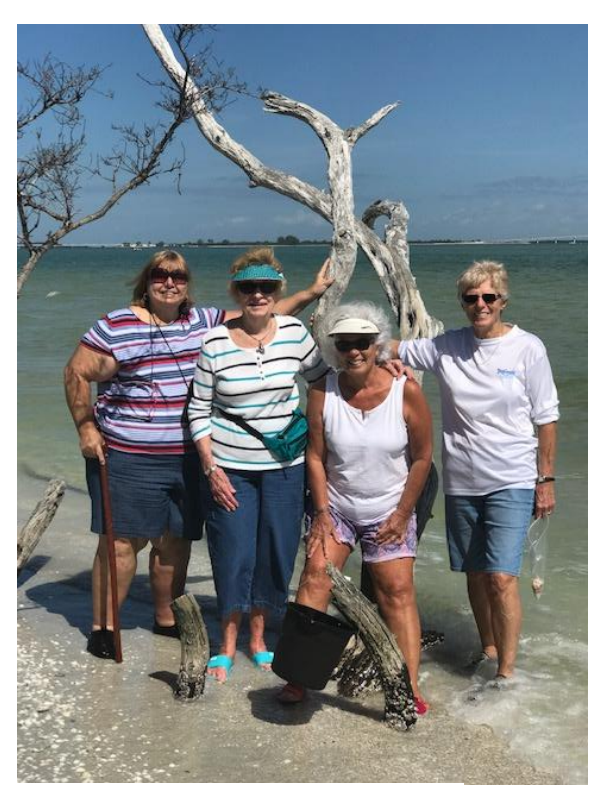
At Lighthouse Beach