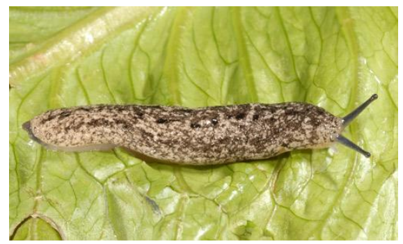
Carolina mantleslug, Philomycus carolinianus (Bosc, 1802).

representatives, the not so colorful slugs. Florida has native slugs, but most often you will encounter the larger introduced European slugs which can be an agricultural pest. Traditionally an environmentally friendly way to trap harmful slugs was to leave a shallow saucer of beer near locations of slug damage. It is not known if the slugs are attracted to the beer or if the ingested libation is toxic, but presumably the slugs died happy.