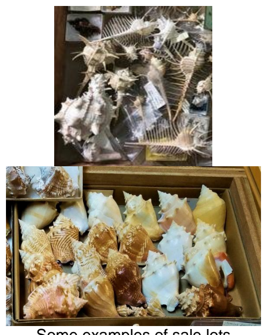
Some examples of sale lots

Offers can be made through midnight, Saturday, June 15, 2019.