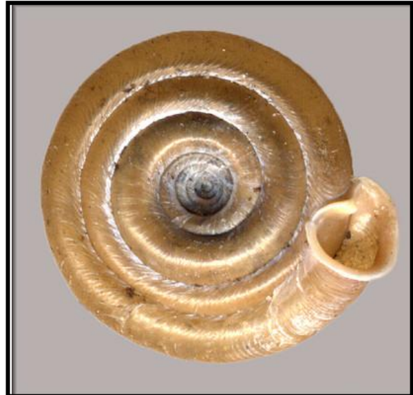
Polygyra septmvolva from JaxShells

Land shells are found in almost every land habitat. Some climb trees to hide from predators; others climb grasses near the shoreline. however are found at ground level, often just below ground or underneath rocks or vegetation. majority of land shells are less than an inch long, but that does not mean they are difficult to find. One of the most common genera of land shells, the Polygyra (Greek for multiple coiled) can be found in urban to forested regions, from the sand dunes of the shores, from moist areas near woodlands and disturbed urban cites. The Polygyra well adapted to many habitats can often been seen by the hundreds, but don't worry they are not harmful and do not eat your garden They are clever enough to seek refuge plants. climbing trees or even walls when local flooding occurs, and then quickly return to land when the water recedes.