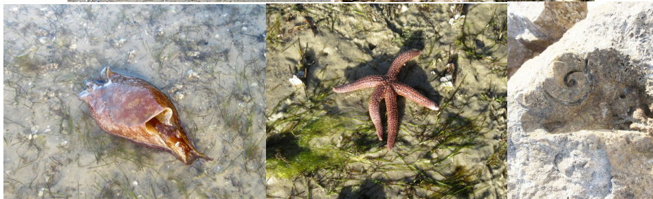
Sea Hare - a mollusc w/ a soft internal shell