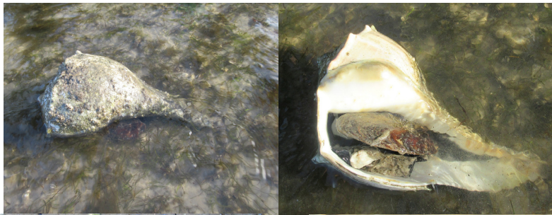
Lightning Whelk showing its Aperature and Operculum