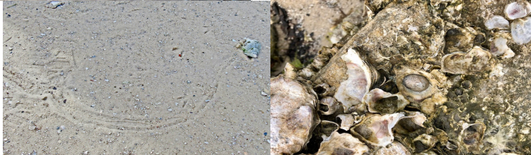
Limpet, Oysters and Barnacles