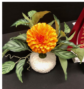
Dahlia made from seashells