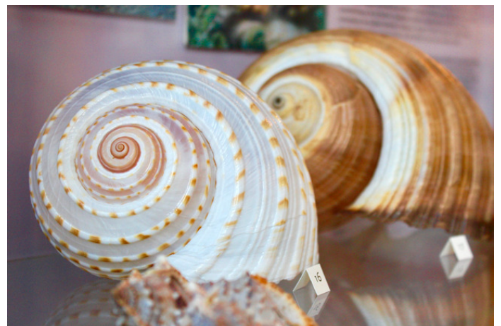
In all, some 2,000 shells are on display at the Redpath Museum.