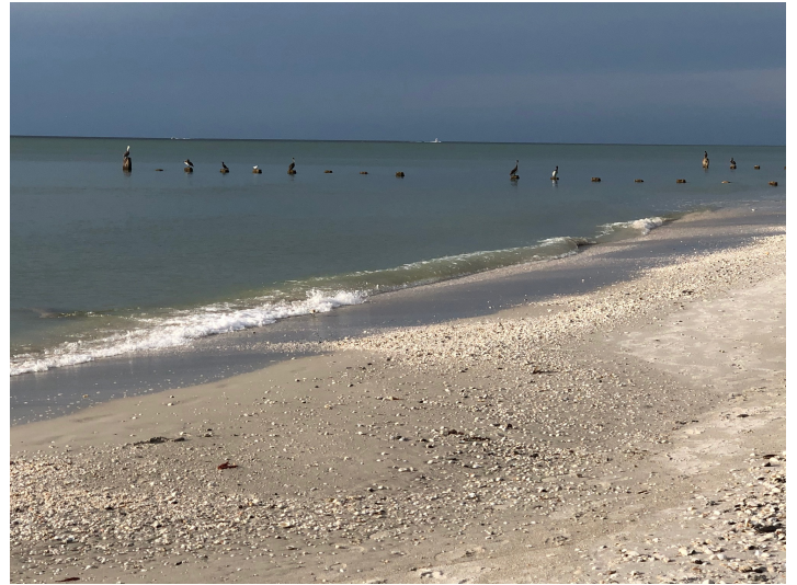
Pelicans on the pilings, shells on the beach