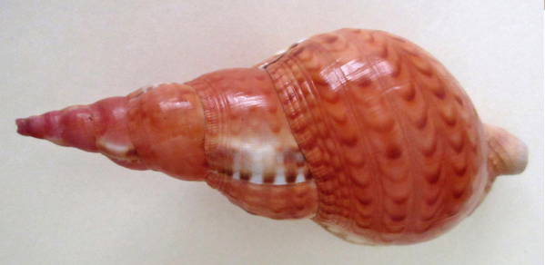
MURICIDAE Murex erythrostomus (Swainson, 1831) Playa Buenaventura Bahia Concepcion, Baja CA Sur 9-97 Pink-Mouth Murex