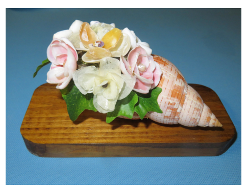
Banquet Table Decoration

A Welcome buffet dinner was included in registration, a great way to catch up with friends and acquaintances, and to make new contacts. To add to the fun of the theme, there was an invitation to attend dressed as your favorite astronaut, fictional sci-fi character, or alien! Quite a challenge, but about a dozen characters were voted upon by acclamation.