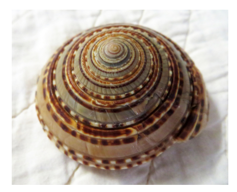
Carolyn's Door Prize! Architectonica maxima Giant Sundial, E. China Sea

One night is given over to the Oral Auction where the more valuable, unique, and rarer shells and related items are offered for verbal bidding. The various offerings were prepared in a manner similar to the Silent Auctions, and were displayed for inspection and close scrutiny prior to the event. Our club's donation for the Oral Auction was a deep water Florida scallop, Caribachlamys mildredae, which reaped COA $60. Again, kudos to the NC Club members who have stepped up for a number of years to help at the actual event. Our mildredae was one of over 100 items auctioned, which netted COA over $15,000, also earmarked for COA's Grant Fund supporting mollusk research. Suncoast Conchologists also contributed a cash donation as a convention Booster, to help with the various convention expenses.