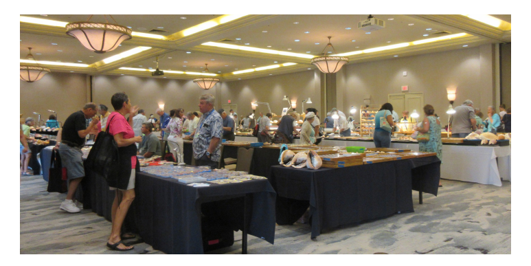
Dealers' Bourse--A huge room filled with hundreds of shells!

So THAT'S what goes on at a COA Convention!