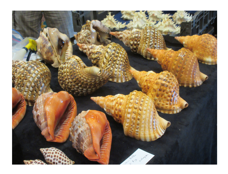
Beautiful Shells at the Bourse