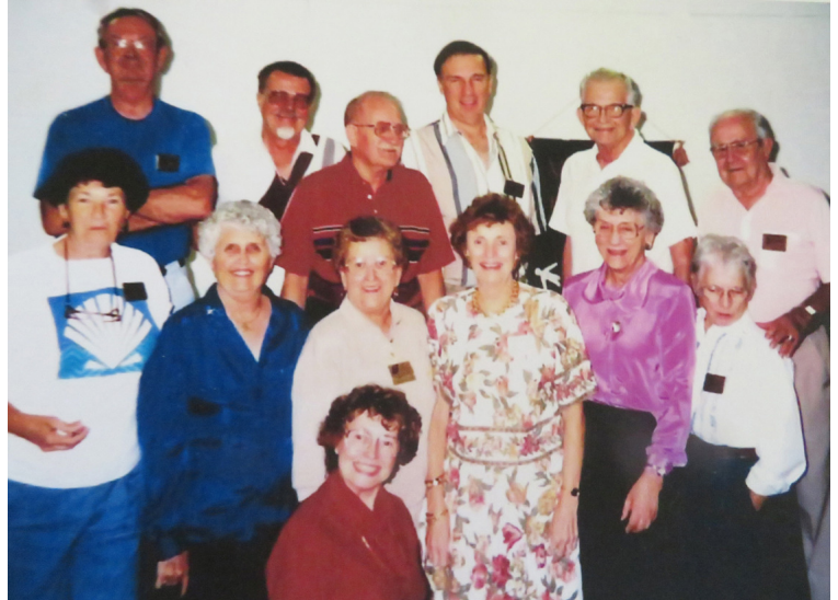
The Founding Members – 3 are still current members