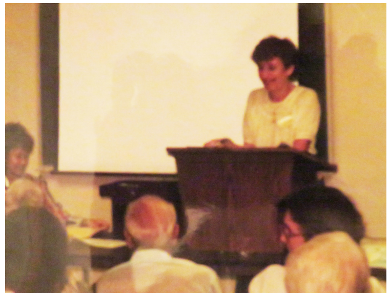
Conducting One of our First Year Meetings