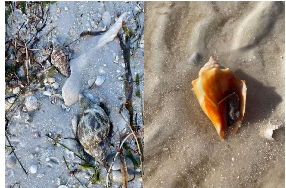
A banded tulip ( Cinctura lilium ) and a true tulip ( Fasciolaria tulipa ) (left) and a live fighting conch ( Strombus alatus ).