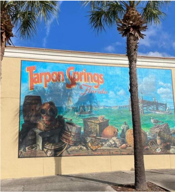
Members of Suncoast Conchologists took a field trip to Anclote on the Odyssey tours boat out of Tarpon Springs on a November super-low tide.