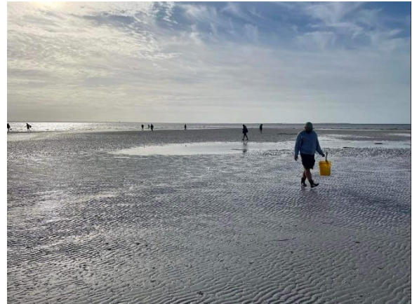
A super low tide at Anclote Key.