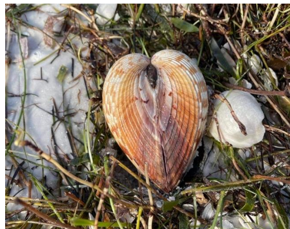
Lots and lots of live cockles ( Dinocardium robustum ).