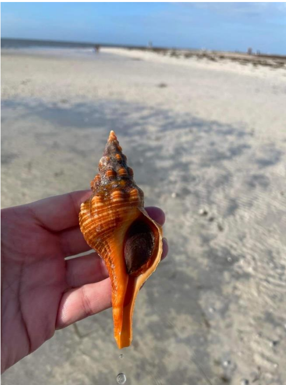
A live horse conch, Triplofusus giganteus .