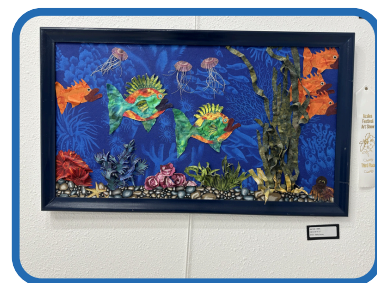
3 rd Place - Fiber Arts Kat Fish Kathy Dovey

Honorable Mention - Fiber Arts "Textured Scarf" Patty Nance