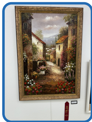
2 nd Place - Painting Flower Walk to the Sea Rimma Motluck