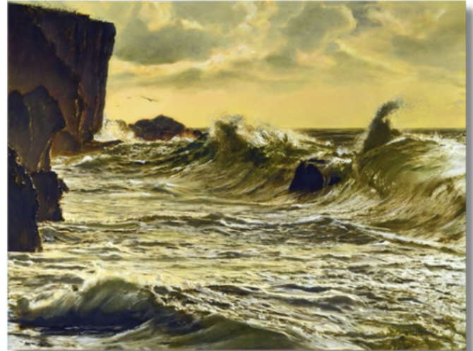
Clash of Titans - Les Cornish