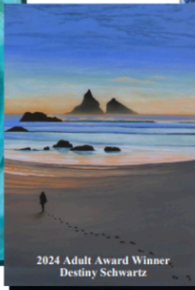
2024 Adult Award Winner Destiny Schwartz