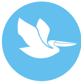
Open Position Vice-President