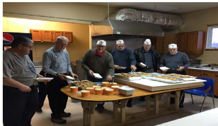
Brother Knights preparing the food for distribution

Finally, we never lose sight or focus of the true meaning of Christmas, Christ's Birthday, and have already participated in the annual Keep Christ in Christmas march, as well as purchased an advertising campaign on VOXM to remind people of the real purpose of these celebrations – Keep Christ in Christmas!