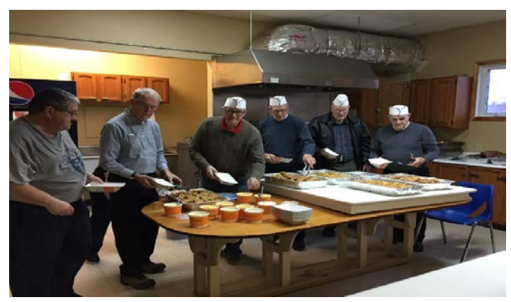
Brother Knights preparing the food for distribution

Finally, we never lose sight or focus of the true meaning of Christmas, Christ's Birthday, and have already participated in the annual Keep Christ in Christmas march, as well as purchased an advertising campaign on VOCM to remind people of the real purpose of these celebrations – Keep Christ in Christmas!