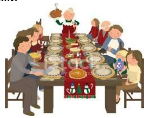
Message from Master