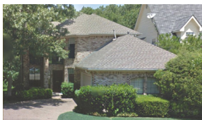
6901 Clear Springs Circle COMING SOON 3 | 2.5 | 2 LA | 2 Car | Creek Lot