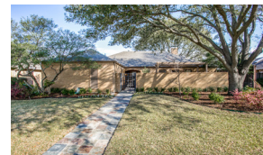
6510 Risinghill Drive UNDER CONTRACT 3 | 2 | 2 LA | 2 Car | Pool