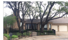
4007 Cochran Heights COMING SOON 2 | 2 | 2 LA | 2 Car | 2 FP