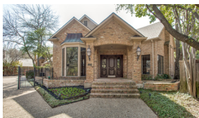
11703 Forest Court Listed for $1,150,000 4 | 4 | 4 LA | 2 Car | Pool