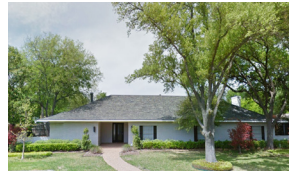
10319 Epping Lane COMING SOON 4 | 3.5 | 3 LA | 3 Car | Pool | .5 acre