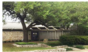
7105 Dye Drive UNDER CONTRACT 4 | 4.5 | 3 LA | 3 Car | Pool