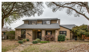
6627 Clearhaven Circle Listed for $450,000 4 | 3 | 2 LA | 2 Car | Pool