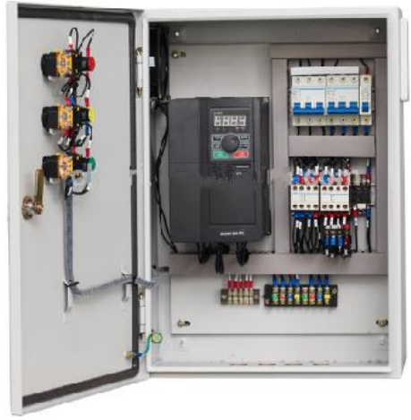
Kiosk & Metering boxes