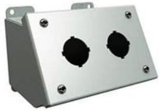
Wall Mount Enclosure