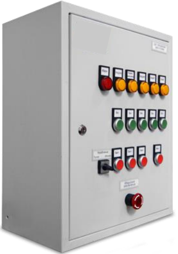
PLC & PCC panels