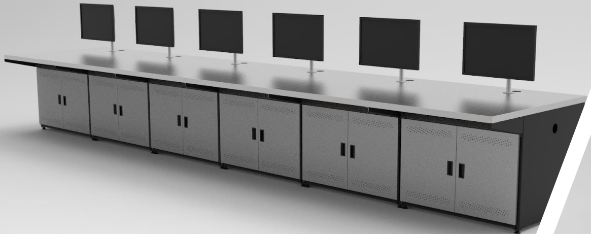
Metal Console (SS/CRCA)