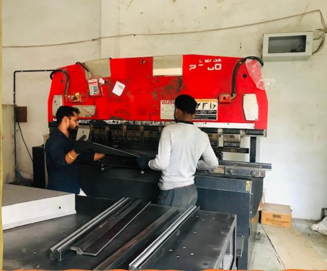
WILA CNC Press Brake