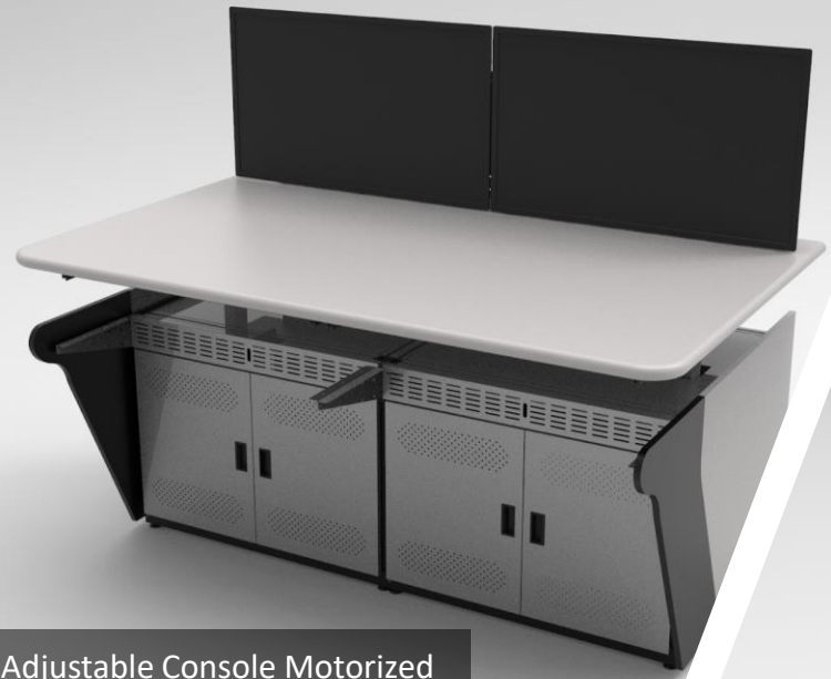
Height Adjustable Console Motorized