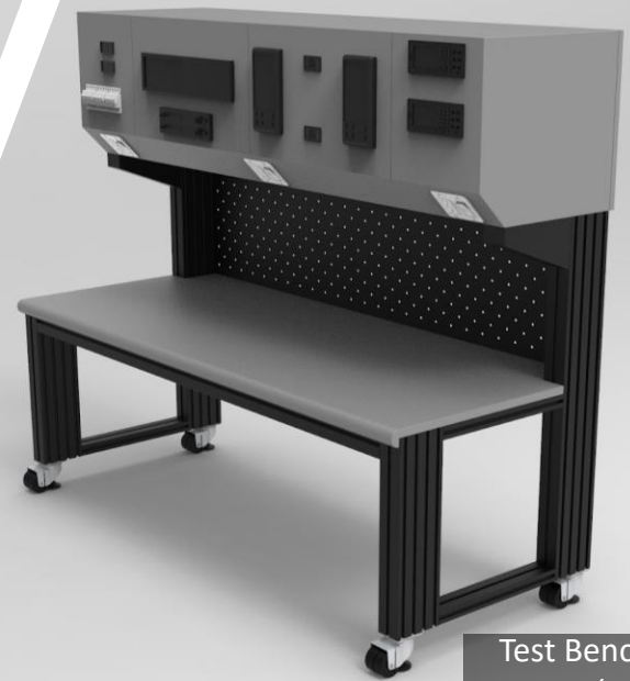
Test Bench/Lab Console (AL /CRCA)