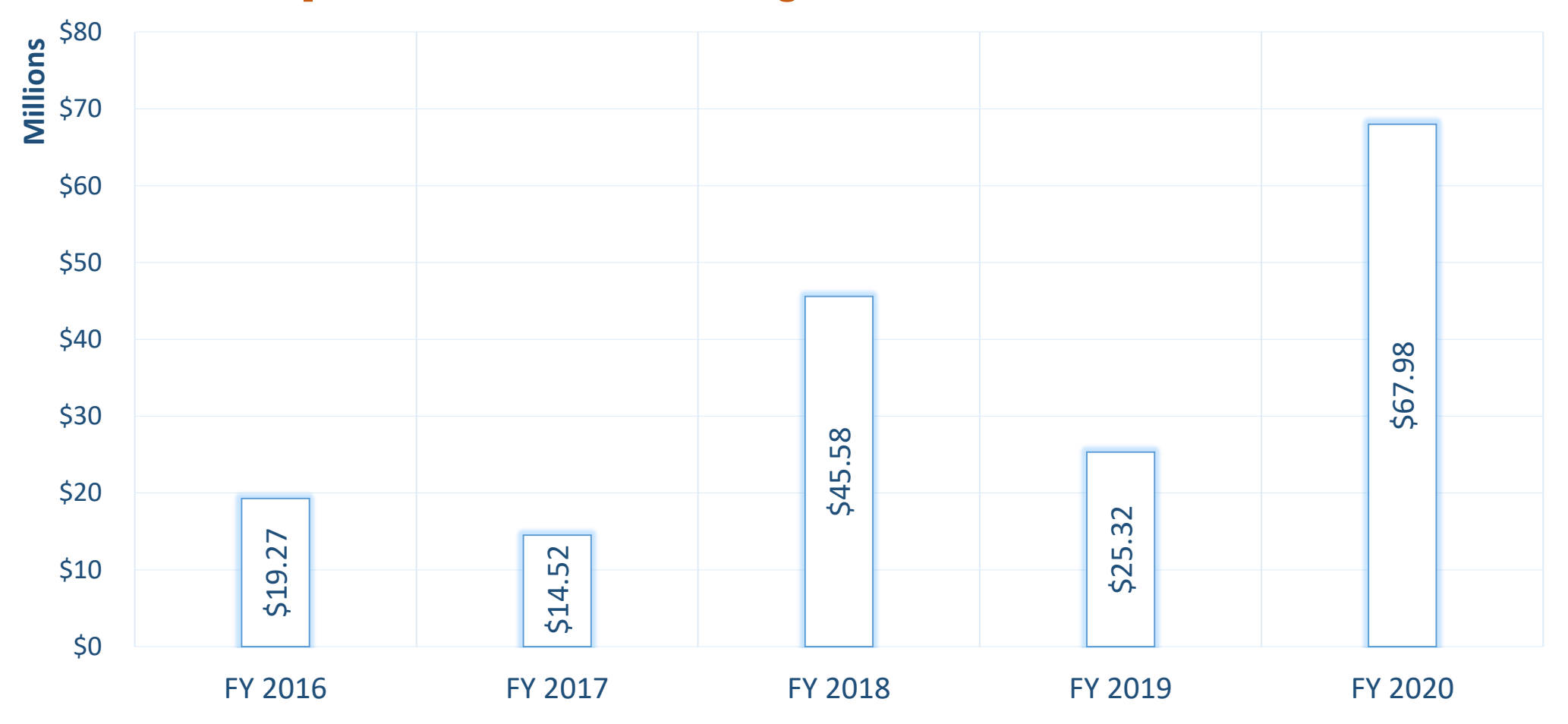
Spelman's Overall Fundraising Trends - Total Commitment