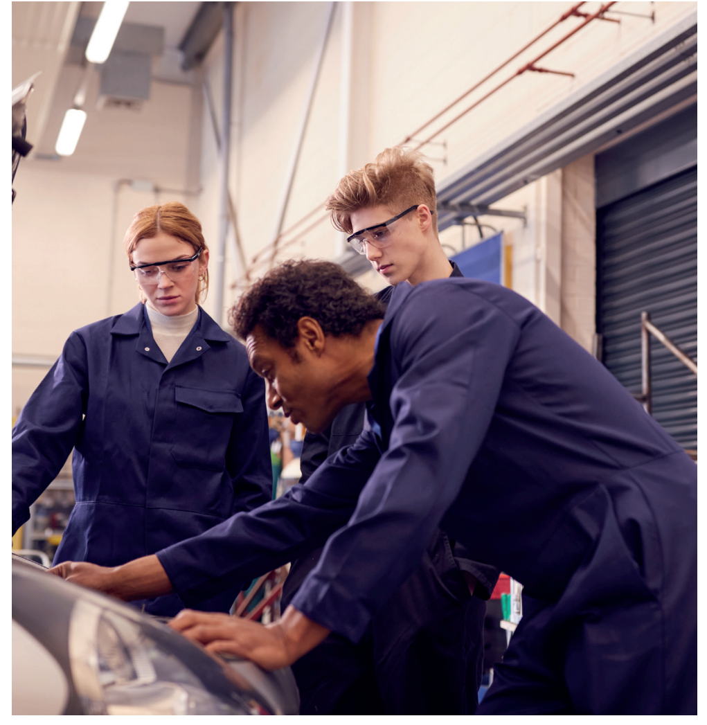
Above: The Prime Minister has made creating jobs and opportunities a central part of his five priorities