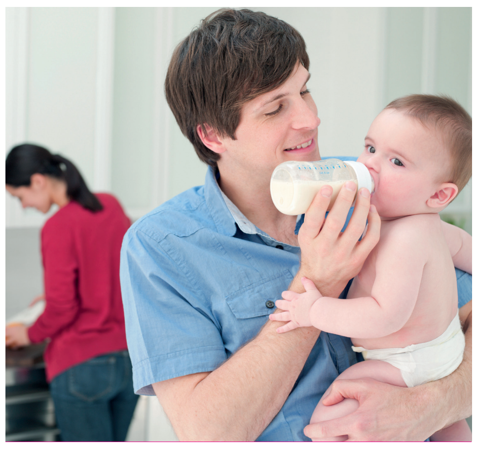
Above: Conservatives are extending free childcare to children aged 9 months to 4 years

This is part of the Government's plan to level up their investment and make sure everyone, wherever they live, can get on in life.