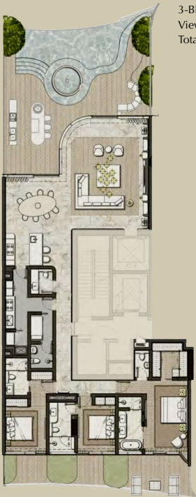
3-BEDROOM View: Dubai Canal Total Area:4,100 sq.m.