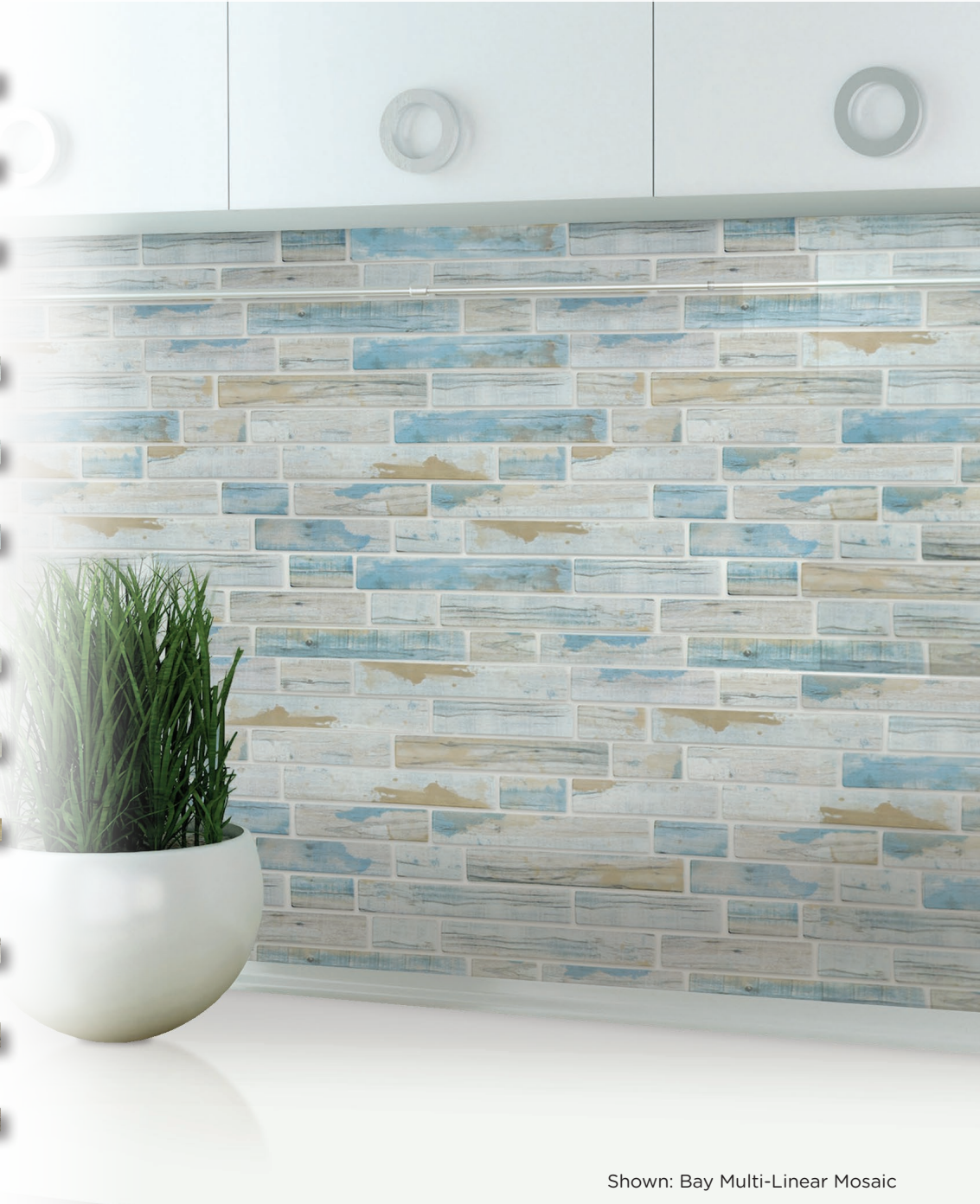
Shown: Bay Multi-Linear Mosaic