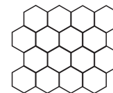
3" Hex Mosaic 11.75x10.25 Sheet