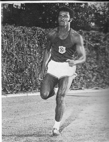
Don Quarrie World Recordholder