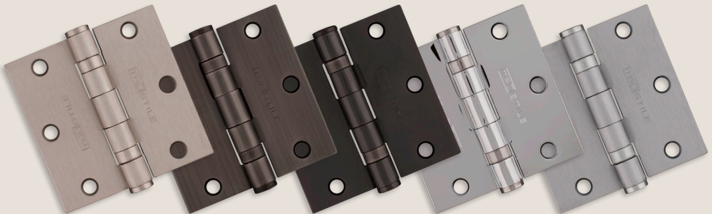
US15 Satin Nickel