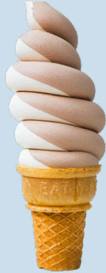
Soft Serve Powder