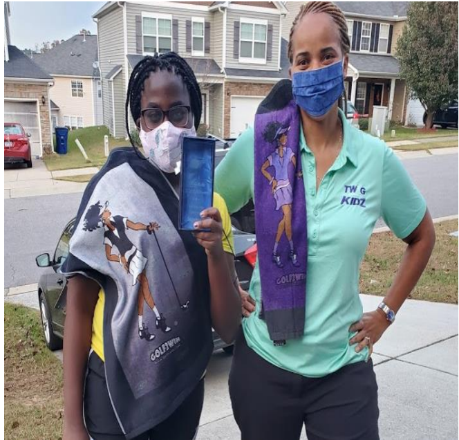
TWIG Kidz Closing Ceremony Deliveries – Visiting a few young ladies who were not able to attend the closing ceremony, by dropping off their achievement trophies and Golfin’ Sistah towels. TWIG Kidz participants ranged from Cary, Durham, Fuquay Varina and Raleigh, NC this year.