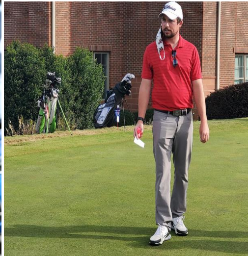
TWIG Kidz Committee Members & Coach – Signing off for the year on Sunday, November 22, 2020.