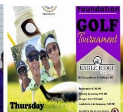
It is all about the Kids. Twig members support tournaments around the Triangle.