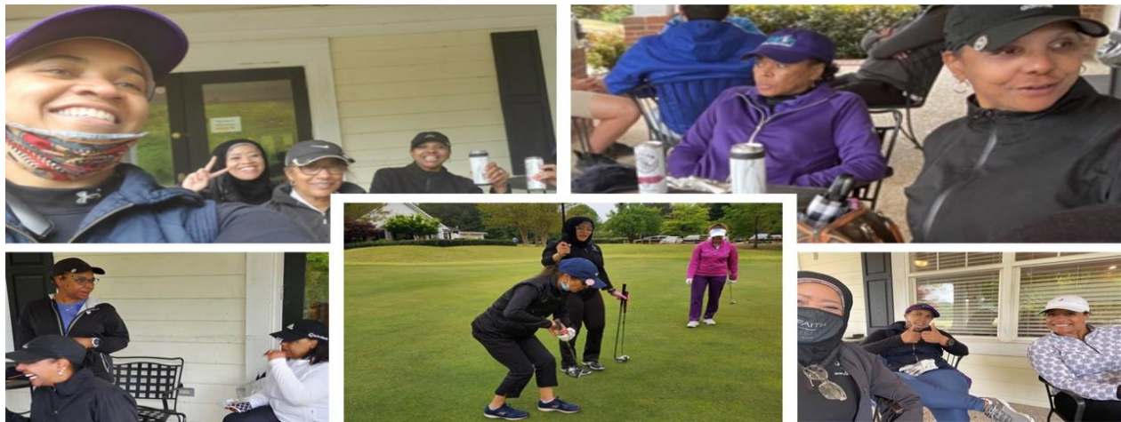
Program Pic 2: First Saturday, April 22 nd at The Crossing Golf Course