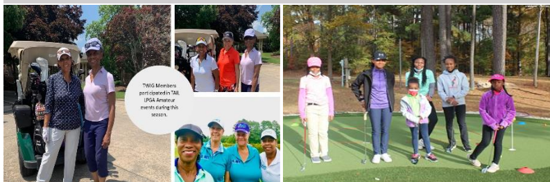
Twig Members participated in TAIL, LPGA Amateur events during this season.