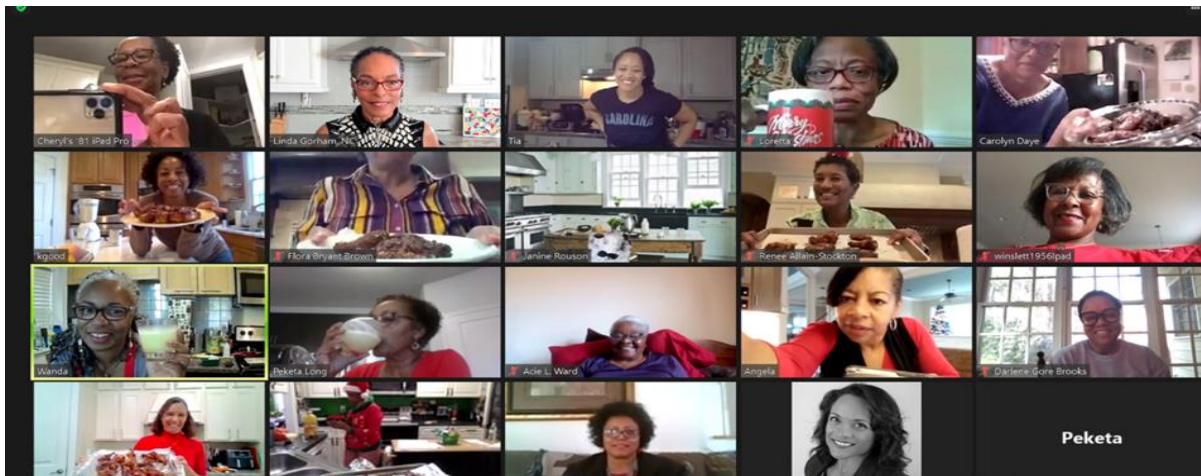
TWIG's Christmas Zoom Party