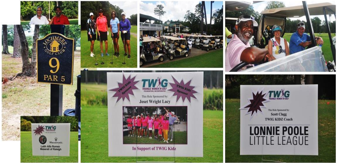
Our sponsors make it all possible.