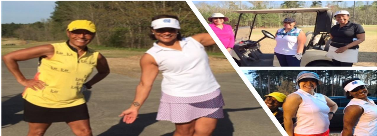
Program Pic 1: First Tuesday Season Kickoff, April 3rd at Falls Village