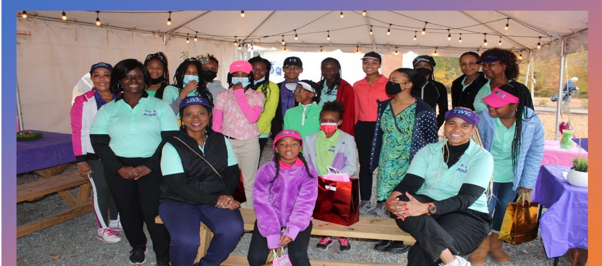
TWIG Kidz Closing Event

The TWIG Kidz had a long and successful season in 2021. The young ladies participated in golf events and tournaments throughout the Triangle. The golf lessons for the season were provided by Lonnie Pool golf professionals and they participated in the Lonnie Pool Little League. The season's closing event was held on November 21, 2021. See more information on the TWIG Kidz, https://trianglewomensgolf.com/twig-kidz in the TWIG Kidz Newsletter.